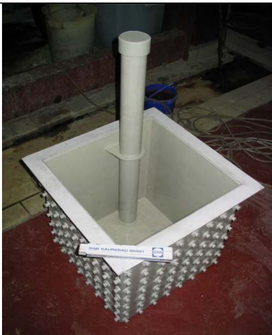
Prefabricated Duple- Wall Sump with Detector Pipe for Leakage indication in production area