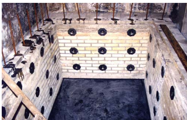
Relining of tiled sumps via DSB Steel plate Relining system