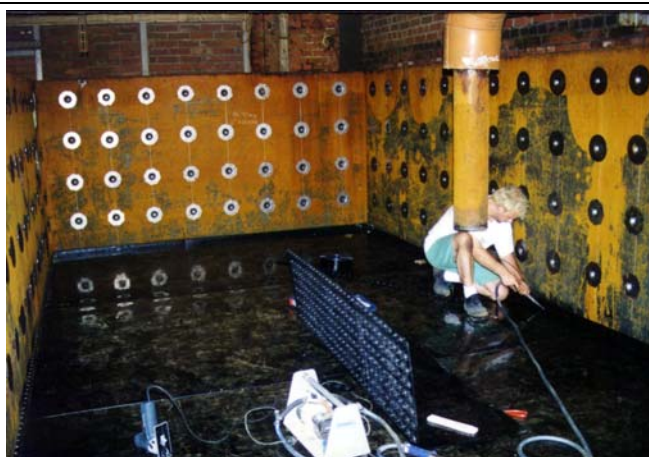
DSB Steel plate Relining system for Steel tanks