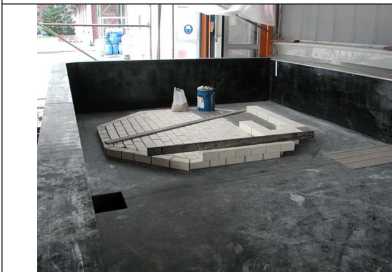
Acid resistant Brick Foundation on Stellaplast floor