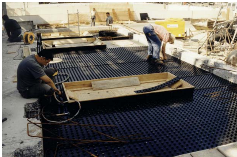
Lining of Ceiling in Neutralisation Chamber