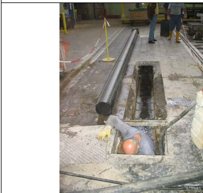
Channel relining with prefabricated PE-Tube in Production area