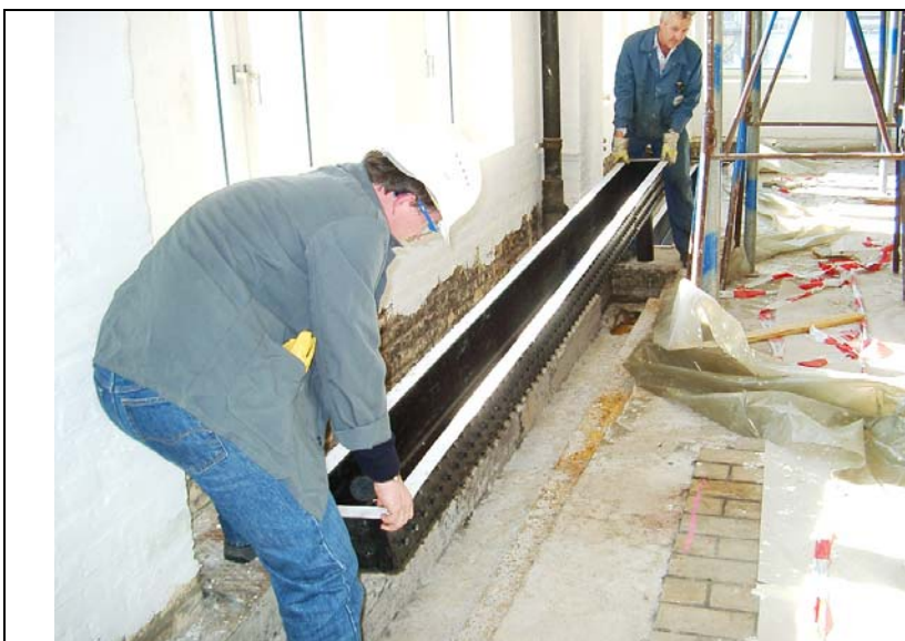
Channel relining with prefabricated PE-Drain in Production area