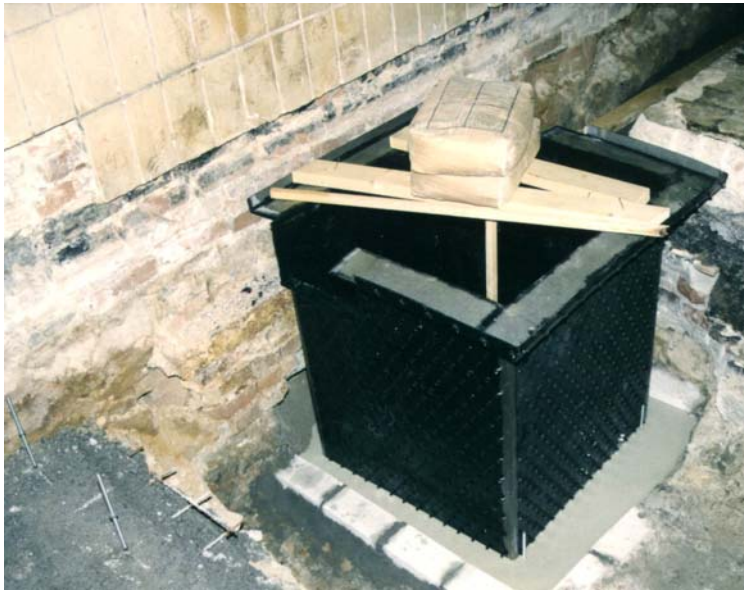
Prefabricated Sump in Production area