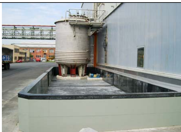
Relining of concrete slab