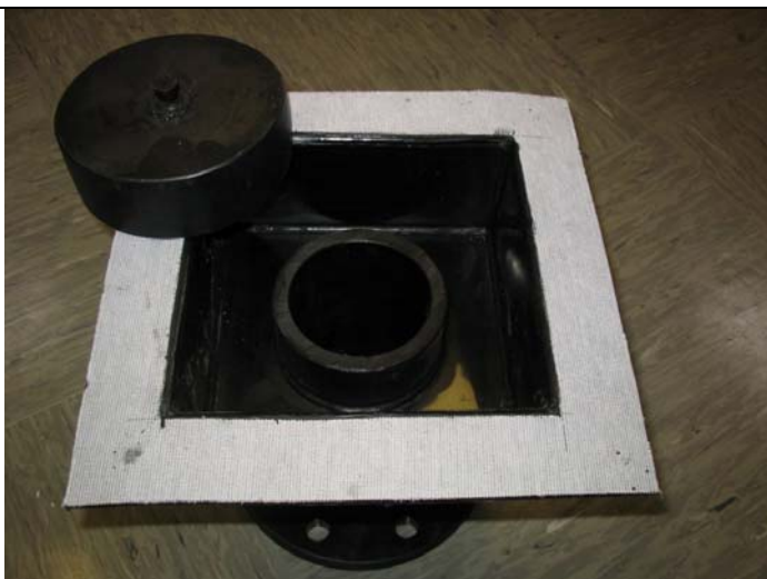
Prefabricated Drain with odour cap and laminated flanges for synthetic resin membrane connection