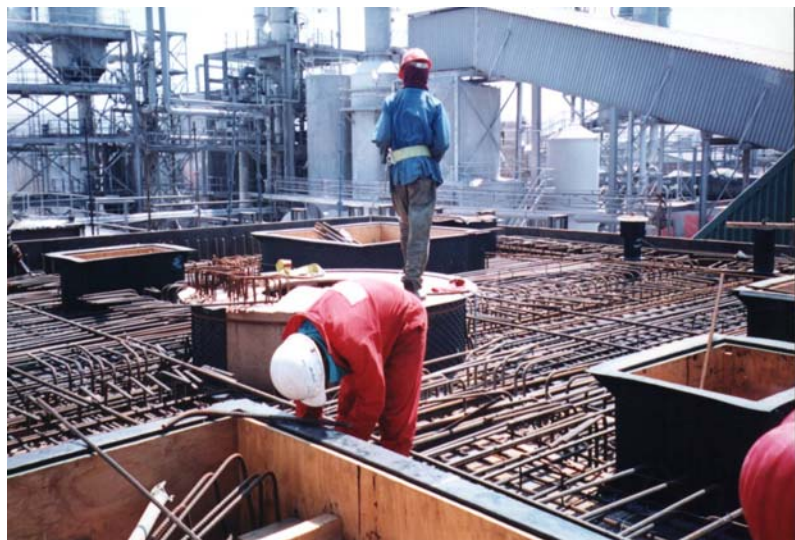
Nozzle-Lining for P2O5 Attack tanks made out of concrete