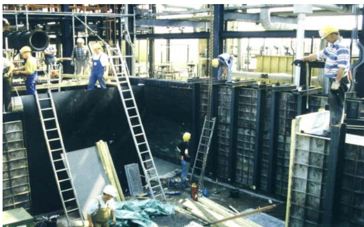
Relining of brick-lined concrete basin