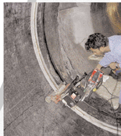
Gas and water leak prevention through welding of the pipe joints